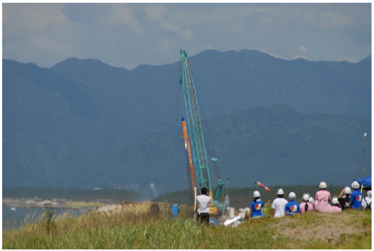
Figure 2. A launching experiment in Noshiro Space Event in 2013

Furthermore, some students have started an advanced project beyond the scope of these WGs. Their final goal is "Launching student's satellites by using student's rockets." Some of the satellites made by the Japanese students will be carried to space on board by rockets. As to the rocket development, they established a project to renew the highest altitude record made by Japanese student. The present project will be finished on August 2014. In the 2nd UNISEC-Global Meeting, we will report the result of such project. In conclusion, UNISON-Japan has been engaged in variety of activities since 2003. Our experience and vision might be helpful for other countries. We will also report the details of these activities at the next meeting and we are more than willing to support other countries to establish their UNISON.