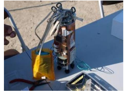
Cansat of joint development