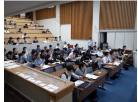
Meeting for sharing information

Create new missions of Satellite and Cansat : Ex2