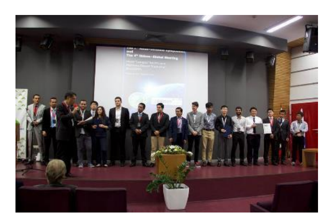
MIC4 finalists and reviewers, Oct. 21, 2016, Varna, Bulgaria