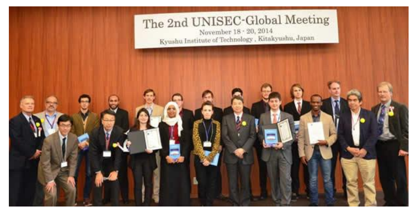
MIC3 finalists and reviewers, Nov 19, 2014, Kitakyushu, Japan