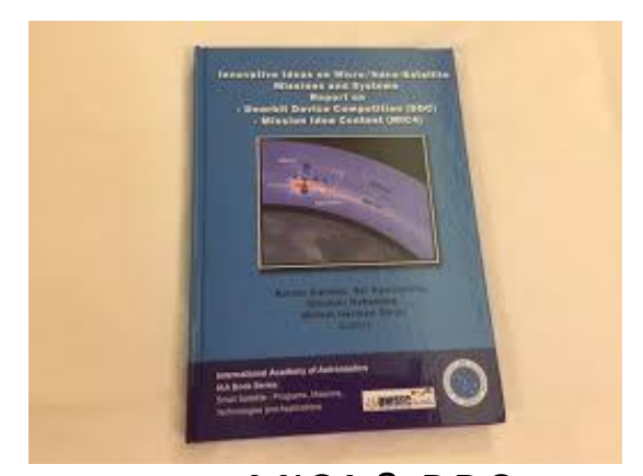
MIC4 & DDC