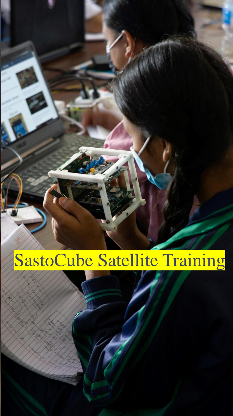
SastoCube Satellite Training