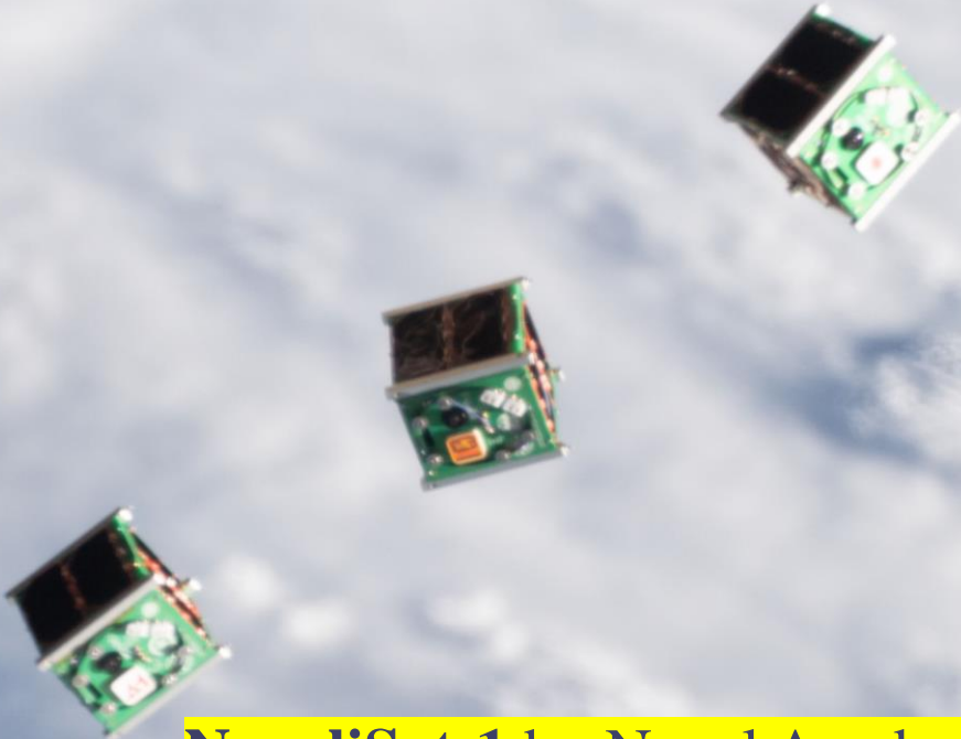
NepaliSat-1 by Nepal Academy of Science and Technology 2019-2021