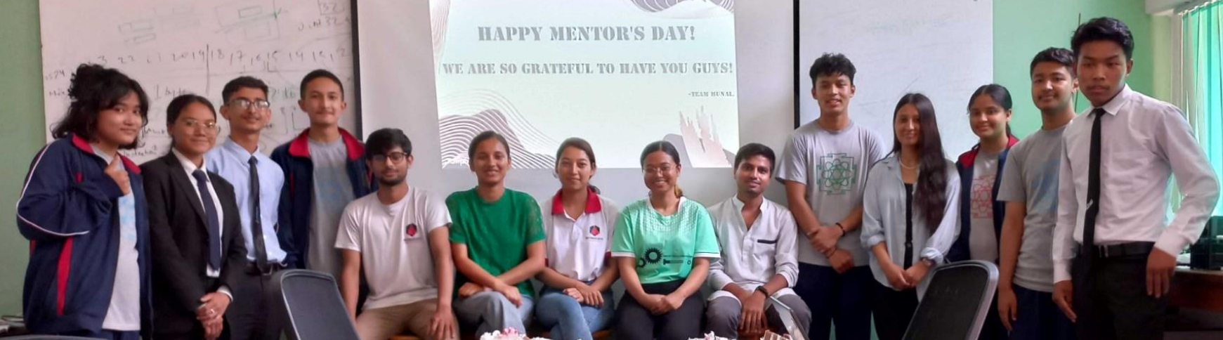
Space Systems Laboratory-KUHS, Dhulikhel