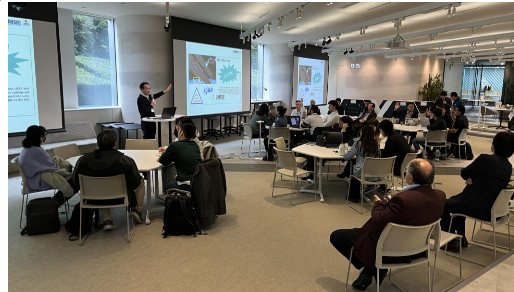
J-CUBE Session at the 9 th UNISEC-Global Meeting

Contact: info-jcube@unisec.jp http://unisec.jp/serviceen/j-cube